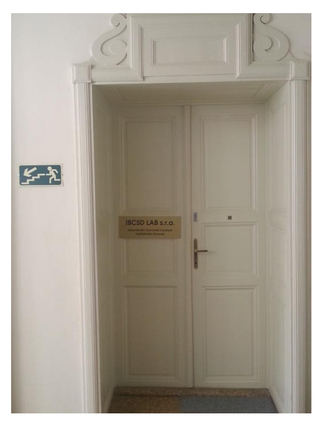
First IBCSD LAB has been setup in Plzen, Czech Republic in a city center renovated brownfield. For the equipent we will use the UPCYCLING skim, to present the ability and mindset of IBCSD network.